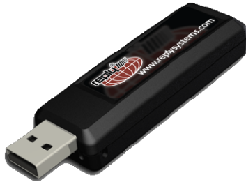
Figure 3. CRS941 Base Station